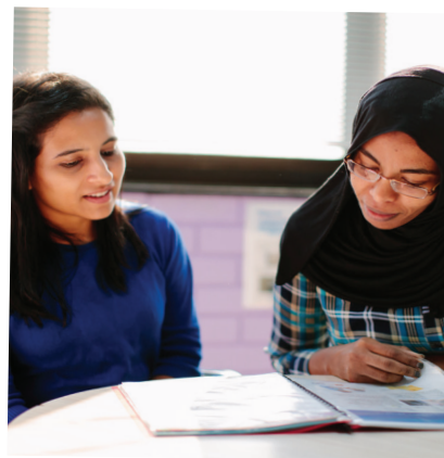
A gift in your Will provides pathways to independence for people seeking asylum