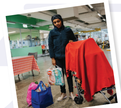
ASRC foodbank provides food security