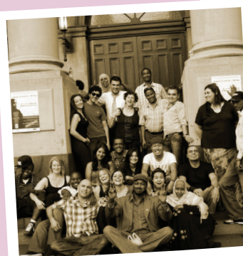
The ASRC is born

We are proudly owned and run by our community and supported by a network of more than 1,000 volunteers and 100 staff in assisting around 7,000 people seeking asylum each year.